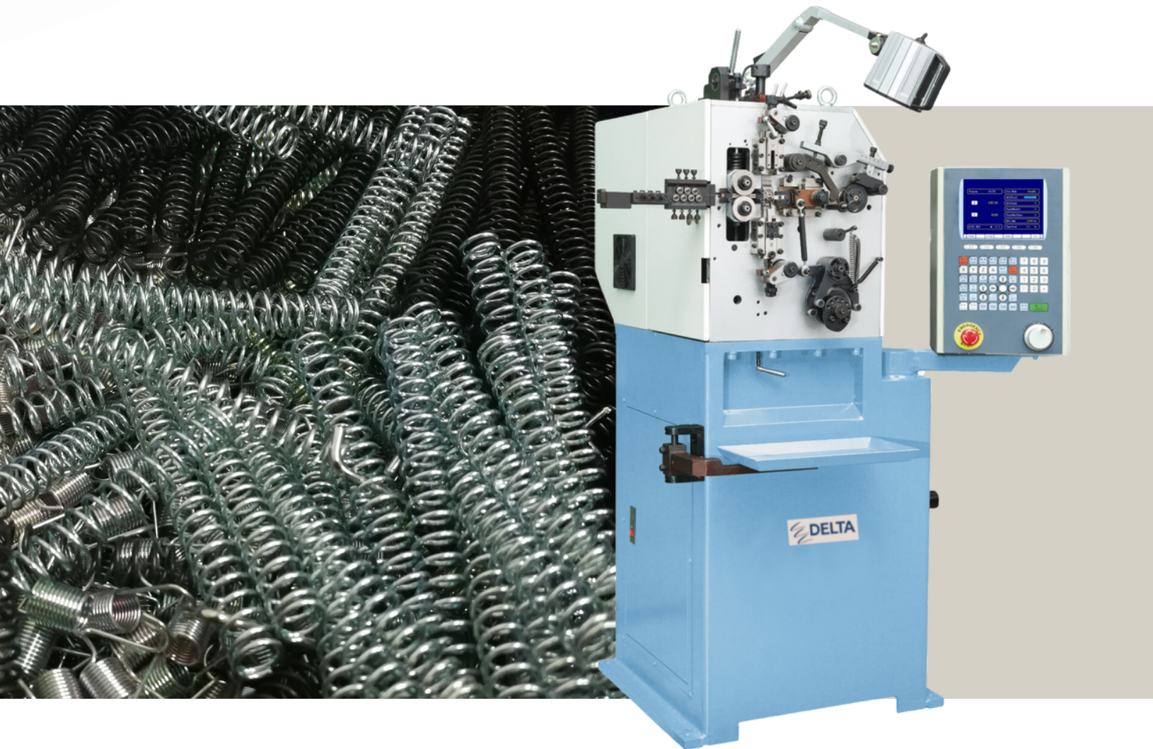
Model Number D-208

A proven ECO coiler series featuring 2 Yaskawa servo motors controlling the wire feed and main shaft rotation. The base D2 machines can be upgraded to include added servo motors, torsion attachments (208 only), and a length gauge.