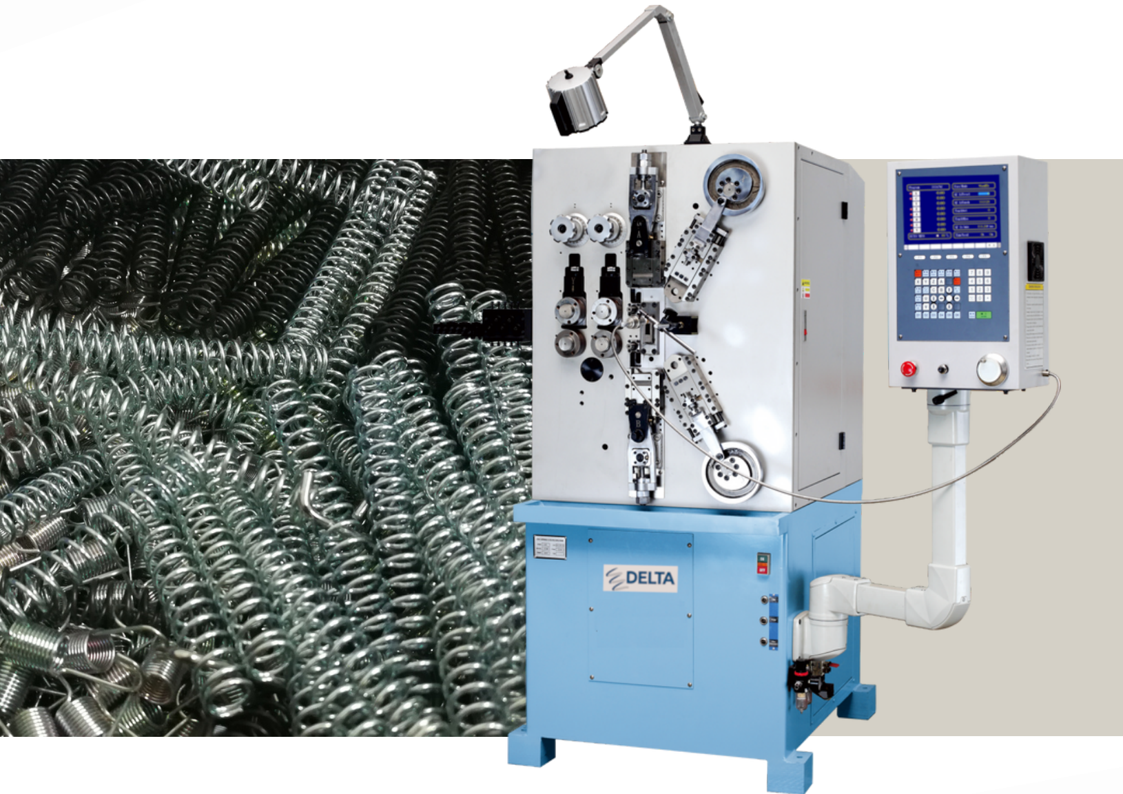
Model Number D-826

The D8 series offers the ease and flexibility of 8 Yaskawa servo motors which independently control the wire feed, coiling points pitch/cutter system, and arbor movement both up/down and in/out. The D8 series can be integrated into an automated work cell or operate independently. The D8 series can be upgraded with a camera or prox. length gauge with a sorter.